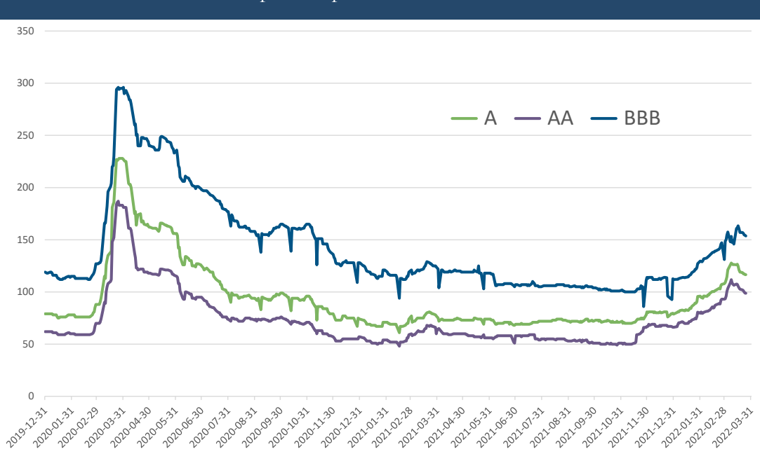
Exhibit 4: 5-Year Investment Grade Corporate Spreads

New investment grade corporate issuance continued to be strong in the quarter in Canada at $46.5 billion vs. $33.3 billion in Q1/21. We continue to see corporate issuers refinance bonds early or lock-in rates prior to further interest rate hikes by the BOC. 5-year credit spreads widened very quickly during the beginning of the pandemic in March 2020 (see Exhibit 4 below), but narrowed by as much as 200bps since peaking; however, during the quarter spreads did widen out +17bps to +38bps, with 5-year BBB bonds widening the most.